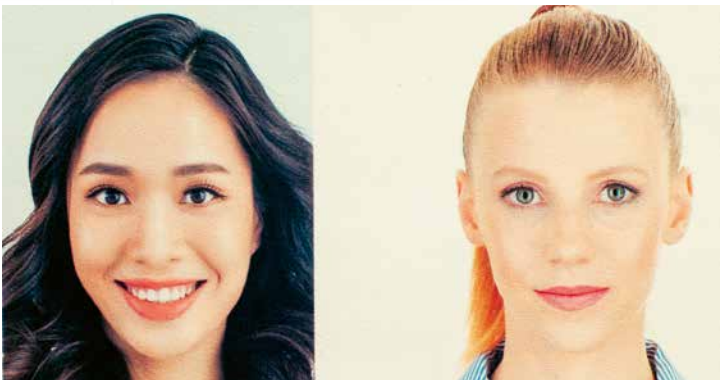
Portrait printed on paper with Digisafe® coating