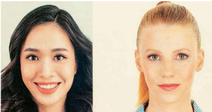
Portrait printed on paper without Digisafe® coating

Inkjet is the most secure personalisation method for security documents because the information (ink) is in the paper and not on top of it.