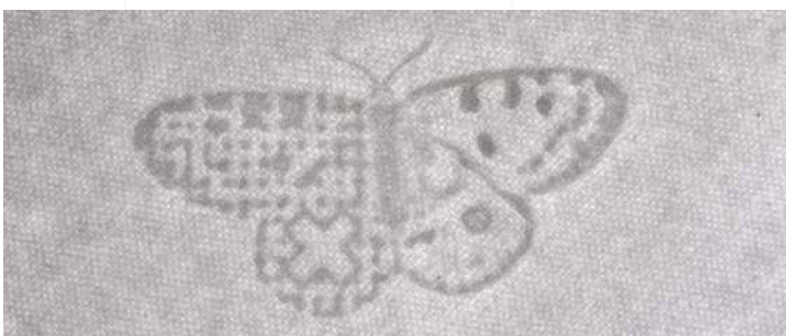
Multitonal watermarks with Signum™ / with electrototype